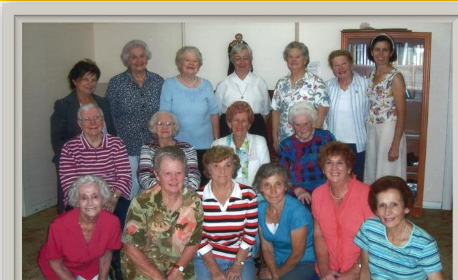
Regina Coeli's St Vincent de Paul Ladies Conference (2008)

Virgin Mary, Mother of faith and hope, an example for this humanity bent by indifference, make me as willing as You to accept the will of God, to magnify and praise His Mercy. Mary, Mother of fortitude, you who knows my heart, do not allow me to become discouraged. I confidently surrender my life into your hands. Heal my wounds. May your tenderness accompany me on the way. Your presence, Mother of love, brings us to experience the joy of seeing our families united. Help me to transmit the tenderness and Love of God to the grandchildren and youth so that, in addition to praying for them, we can pray with them. Mary, may the gift of the Holy Spirit intercede for me: sustain my weakness; breathe into my heart the consolation that I may leave traces of faith among the young, bearing witness to the beauty of life, knowing that life has a limit and that beyond it lies before us our Father's embrace. Amen.