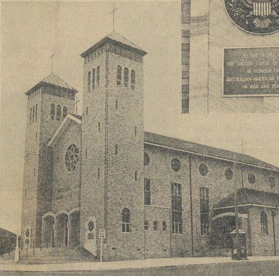
The new Roman Catholic memorial church at Beverly Hills is of traditional design with cream brick walls, and twin towers. Inset: One of the symbols of friendship.