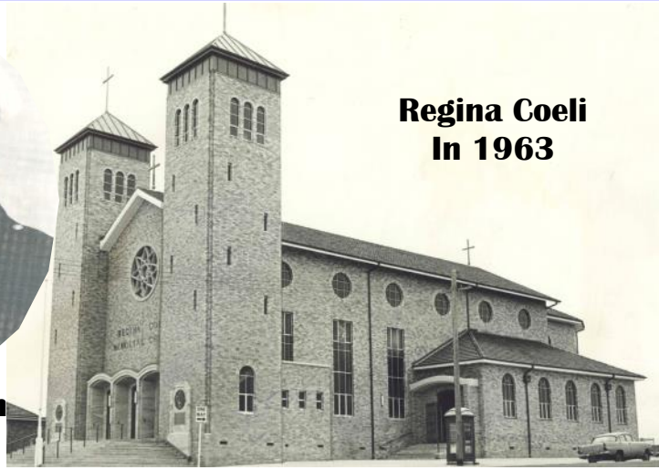
Regina Coeli In 1963