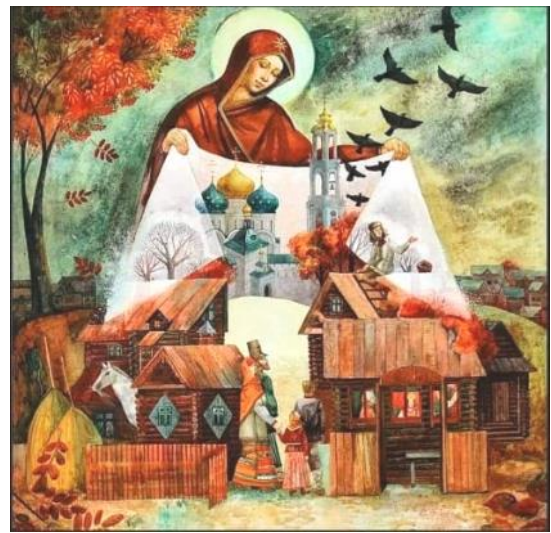
Our Lady of Ukraine(?)