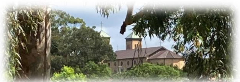
A photo taken by a parishioner on Australia Day 2022