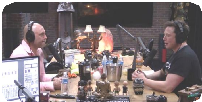
Joe Rogan conducts lengthy and unedited interviews.

Don't delay supplies of calendars are very limited.